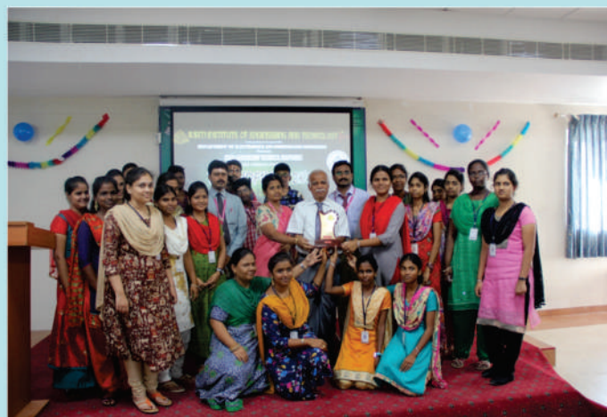
Group Photo - TECHNOFILA2K19 on 21-02-2019